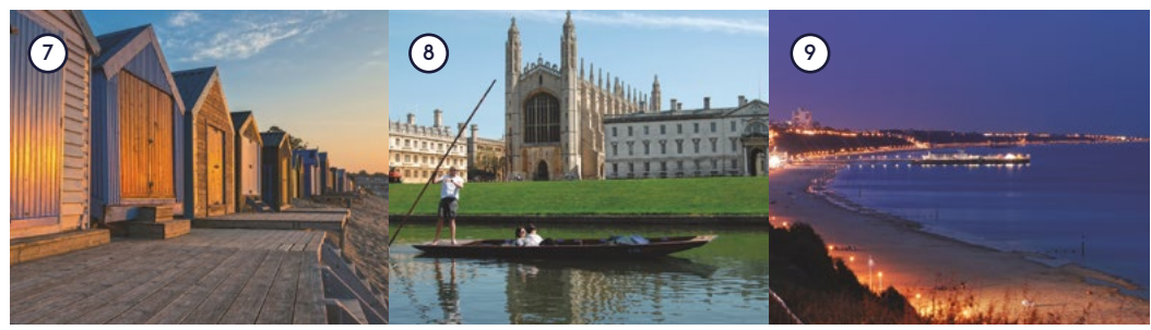
Porth Neigwl Abersoch