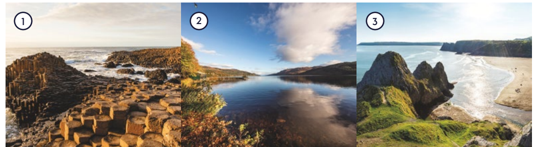
Giant's Causeway County Antrim