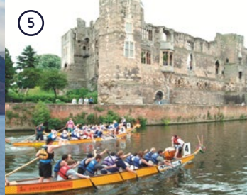
Dragon Boat Festival Nottingham