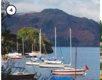
Ullswater Lake District