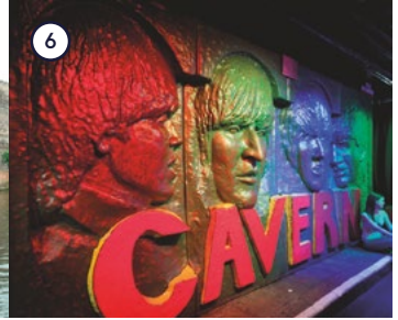
Home of The Beatles Liverpool